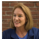
Jenny Durkan Mayor, City of Seattle

"Seattle is home to some of the most innovative thinkers and technologists anywhere in the world who want to use their talent to address social challenges. It's why we formed an Innovation Advisory Council, and it's why groups like DemocracyLab exist."